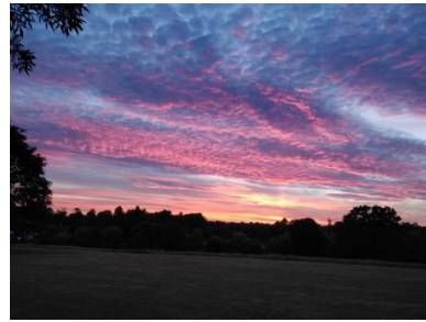
Winning photo "Mackerel Skies over Abbey Fields"