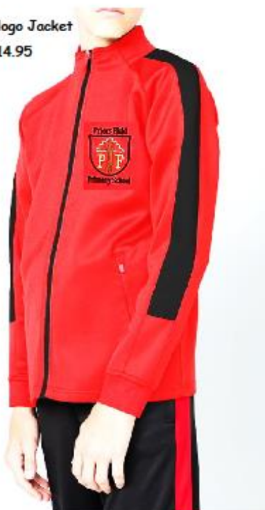
School logo Jacket from £14.95