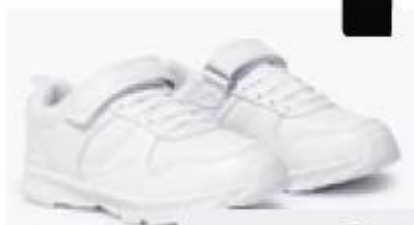
Black or White trainers