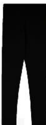
Black leggings/ tracksuit bottoms