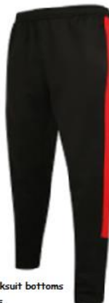
School tracksuit bottoms from £11.95