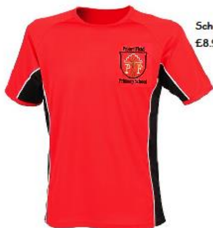
School logo top £8.95 (approx.)