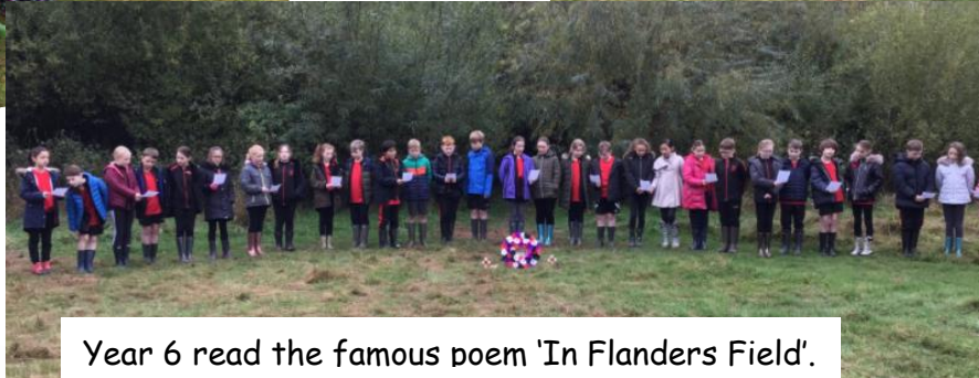
Year 6 read the famous poem 'In Flanders Field'.