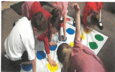
Photo above is Year 1 playing Twister to use positional language.