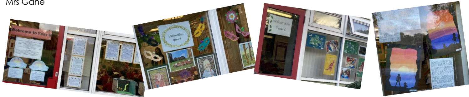
Welcome to Priors Field.